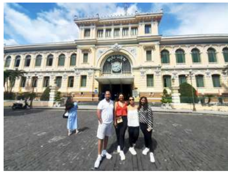
Centre Post Office