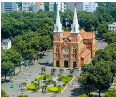
Cathedral of Notre Dame

Distance Tan Son Nhat Airport – Saigon Central: 7 – 8km -> 30 minute transfer