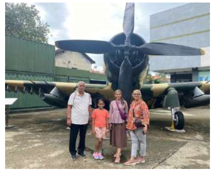
War Remnants Museum